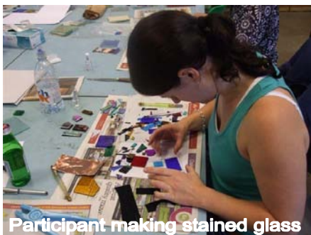
Participant making stained glass