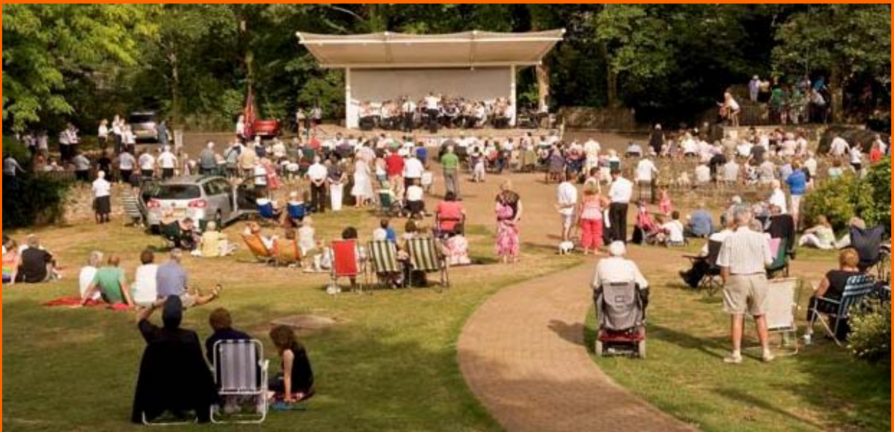
The Easton Salvation Army Band, annual Hymns in the Park, played July 2010 at the Bandstand in Keynsham Memorial Park.