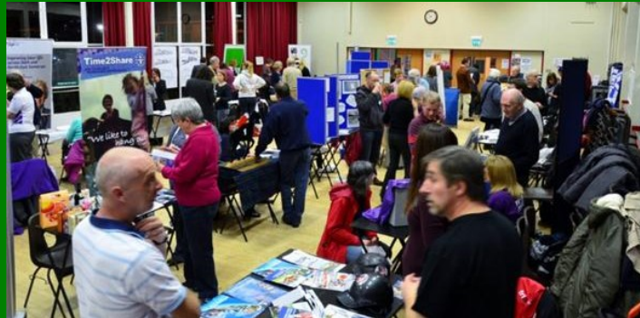
Large print copies available on request