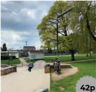
Neighbourhood Development Plan Community Plan that will guide the future growth and development of Keynsham