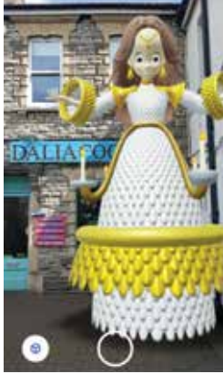
One of the Jubilee Beacon Trail's augmented reality characters

In celebration of the Queen's Platinum Jubilee, an augmented reality trail was installed around the High Street. The Cultural Consortium created a film about royal memories and of our town then and now, featuring Keynsham & District Mencap Society, Abbeyfield House and residents. The film can be watched at www.bit.ly/3uFOa3n .