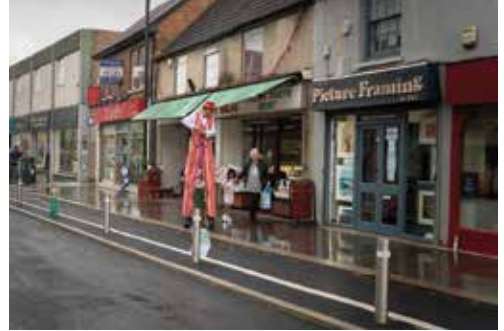
Stilt Walking on the High Street.

Keynsham Music Festival Association received funding to bring their Saturday Family Festival to the Town Centre. To the delight of passersby, daring stunts and beautiful acrobatic feats were performed in Market Walk and along the High Street.