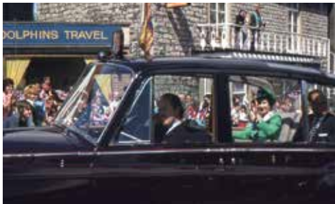
The Queen in Keynsham in 1973.