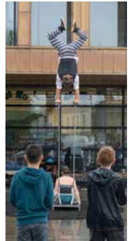
Acrobatics in Market Walk.

Keynsham Music Festival Association received funding to bring their Saturday Family Festival to the Town Centre. To the delight of passersby, daring stunts and beautiful acrobatic feats were performed in Market Walk and along the High Street.