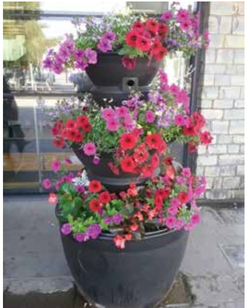
An example of one lovely display outside of the library.

Our volunteers have worked extremely hard to